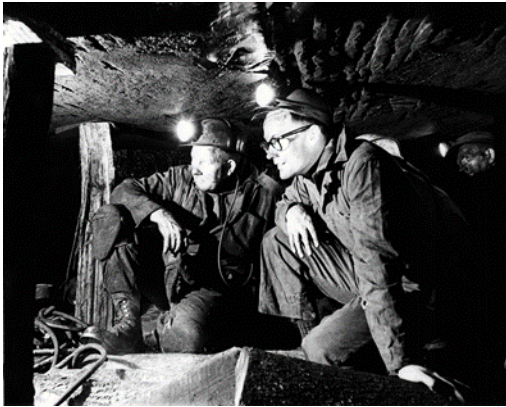
Centers for Disease Control and Prevention Public Health Image Library. Photo ID 9542. Accessed July 19, 2018. Photographer unknown.