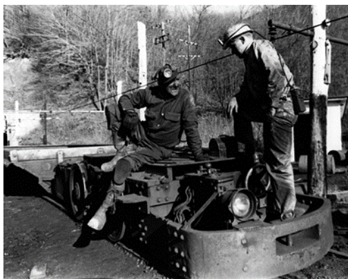
Centers for Disease Control and Prevention Public Health Image Library. Photo ID 9550. Accessed July 19, 2018. Photographer unknown.