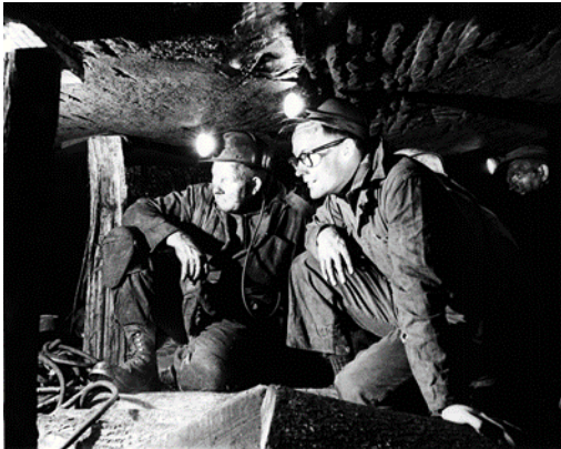
Centers for Disease Control and Prevention Public Health Image Library. Photo ID 9542. Accessed July 19, 2018. Photographer unknown.